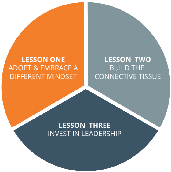
INVESTORS ROLE IN QUALITY COLLECTIVE IMPACT

Investors will need to look for braided funding models that are public/private in nature, rather than focusing on being a sole investor. This will leverage existing funds and ensure their investment is combined with others to achieve greater impact. It requires a shift away from individual philanthropic investment to more collaborative investment, not only among private sector funders, but also with public sector resources. For example, the United Way of Salt Lake is pioneering a completely different way for public and private investors to work together through social impact bonds. This groundbreaking work in the education space is focusing private dollars on innovation and public dollars on sustained impact. Perhaps most importantly, it is helping leaders across the country think in new ways about what we can do with the concept of public/private partnerships.