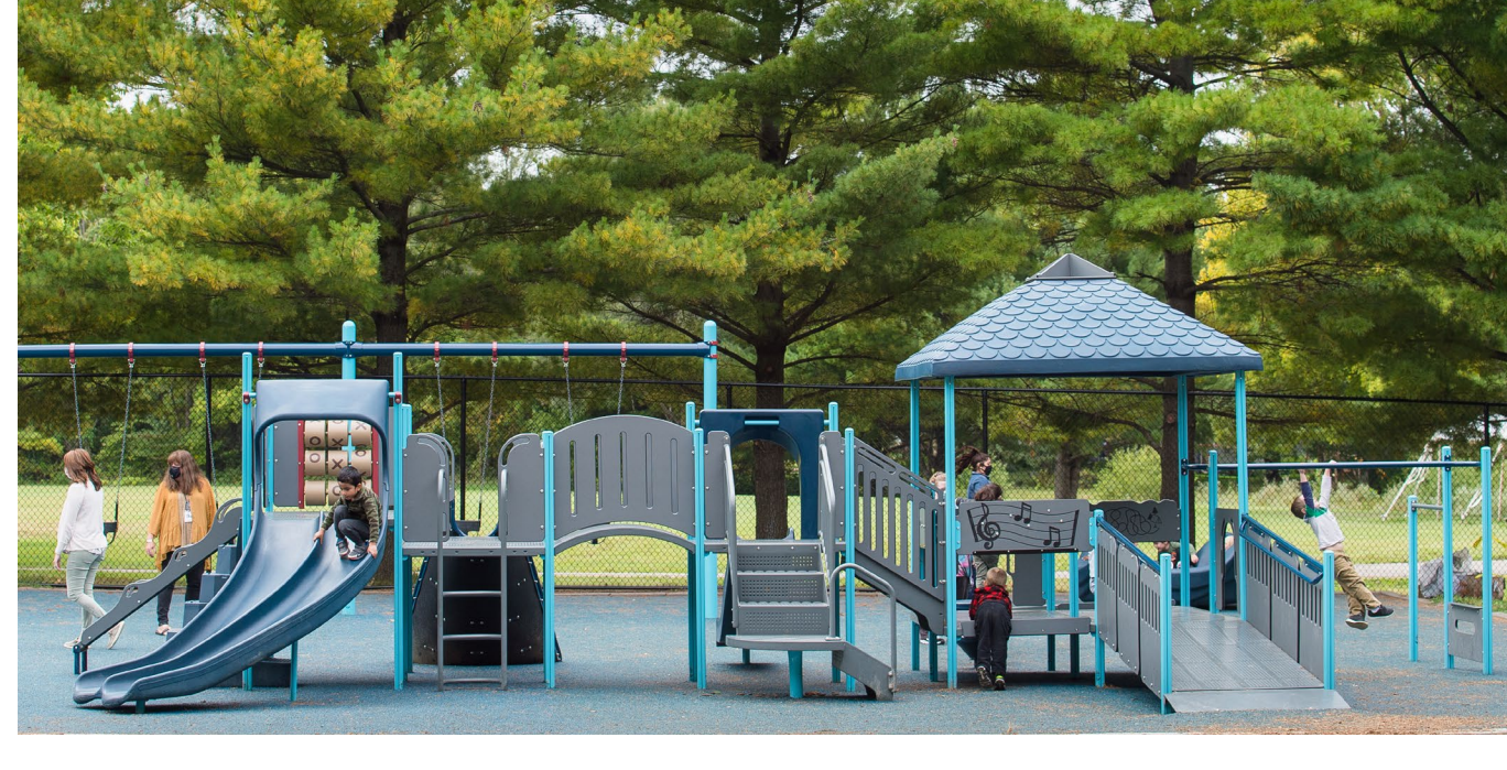
IMAGE ABOVE: The kid-designed playground at the Northfield Community Education Center opened in September 2020.

Feedback from the parents was also incredibly important and especially difficult to gather in these circumstances. The project team went broad, giving parents multiple avenues for sharing comments. The most successful strategy was gathering input via Facebook comments and messaging in English and Spanish.