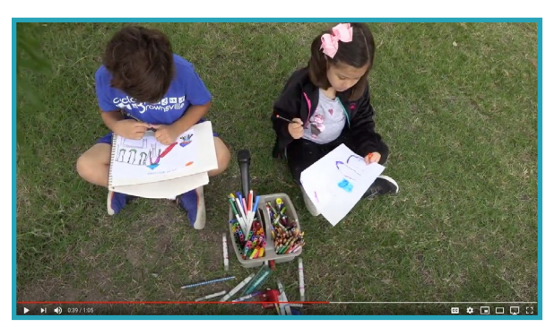
Click here to watch video

IMAGE ABOVE: In Spanish, the idea of working "side by side" is expressed by the word contigo — with you. Contigo is what RGV FOCUS is all about. The video below shows how this StriveTogether network member is working with youth to design a new playspace.